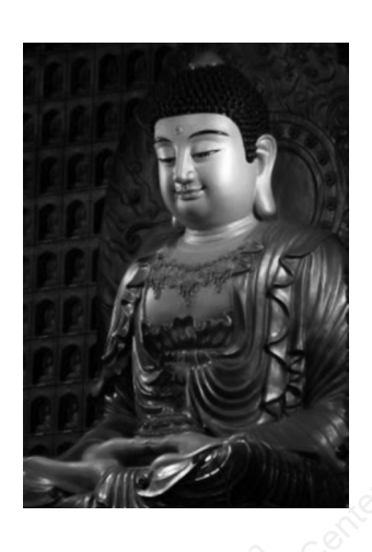
The word Buddha means "Awakened One" and does not only refer to the historical figure.

Any human being who is totally dedicated to serving others and completes the path to full awakening can become a Buddha; after all, Sakyamuni Buddha was a teacher, not a god. As Buddhism spread throughout India, Pakistan, Afghanistan, and Central and East Asia, other Buddhas became part of the religion. Two of the most popular Buddhas are Amitabha and the Medicine Buddha. These Buddhas are often shown on either side of Sakyamuni in the Main Shrine, but a shrine may also be dedicated to one of them or other Buddhas depending on the focus of the temple.